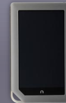
Nov. 2011 Barnes & Noble Nook Tablet