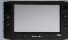
May 2006 Samsung Q1