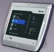
Jul. 2002 Microsoft Smart Display