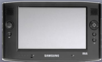
May 2006 Samsung Q1