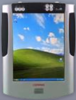
2001 Compaq Tablet