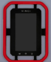
Aug. 2011 Vinci Tablet