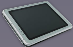
Nov. 2002 Compaq TC1000