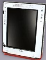
Jul. 2005 Electrovaya Scribbler SC3000